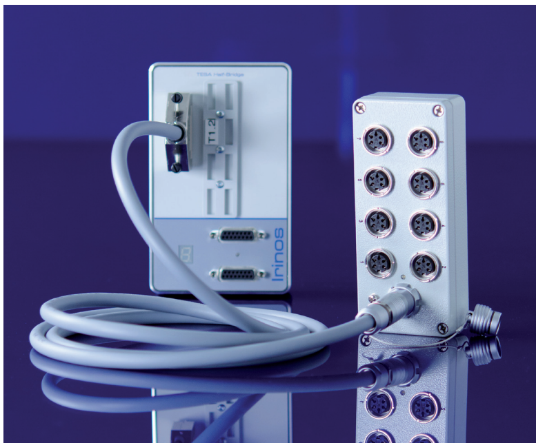
Quick-change system TAS10

It is further possible to un-plug or plug multiple measurement probes simultaneously from/to the measurement electronics without requiring a power-off. This allows for quick exchange of different measurement devices.